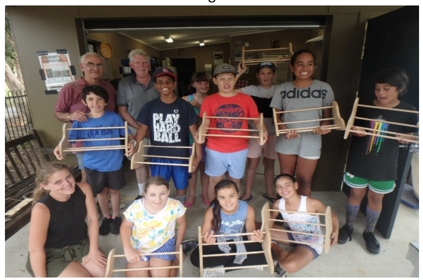
CHILDREN WITH THE FINISHED BOOKSTAND

It was all such a great success that a 4-hour session became 6 hours and most of the children completed the job in that time. A few came back on the Friday to complete the job by decorating the Bookstand with the pyro graph. It is something that we would certainly consider doing again. It was a great experience for all the children, and who knows we may have some new woodworkers in the making.