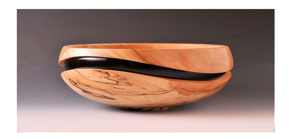
10AM -4.00 PM