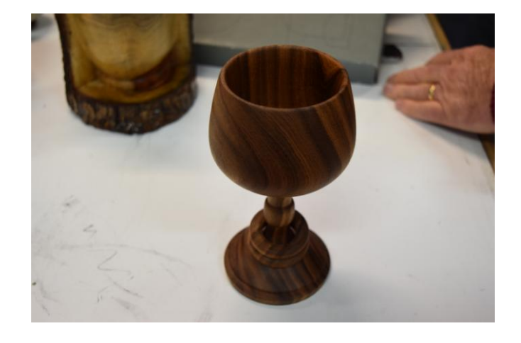
Sam Shakouri; A goblet with captured rings