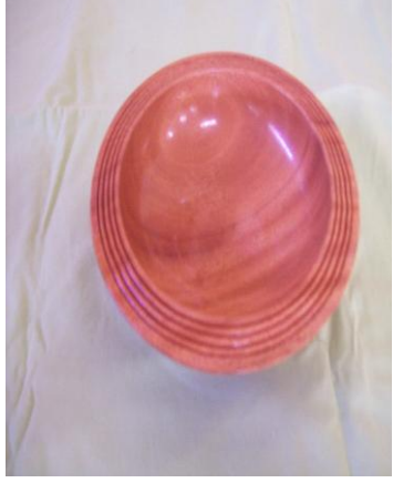
Medium and small bowl from nest of bowl