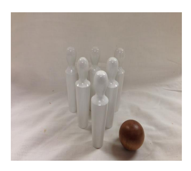
Pins & Ball - Mick Bouchard