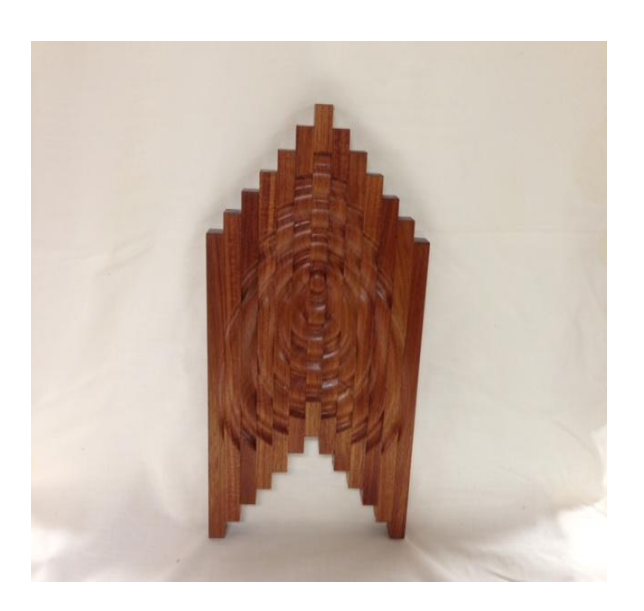
Mick Bouchard – Wall Plaques (Blackwood & Tassie Oak (respectively)