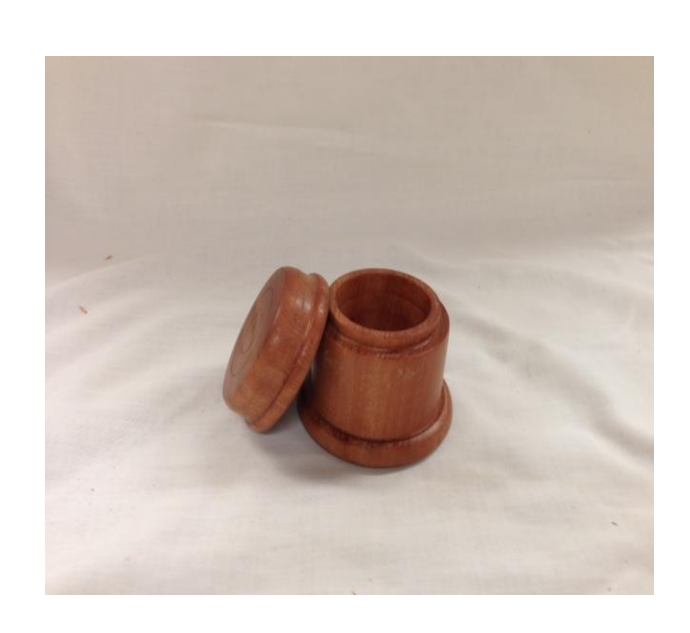
Bob Thompson – Blue gum Lidded Bowl