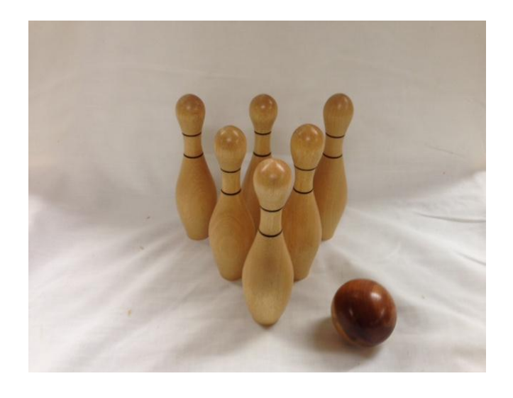
Pins & Ball (Camphor laurel ball & Ash wood pins) Graeme Stokes