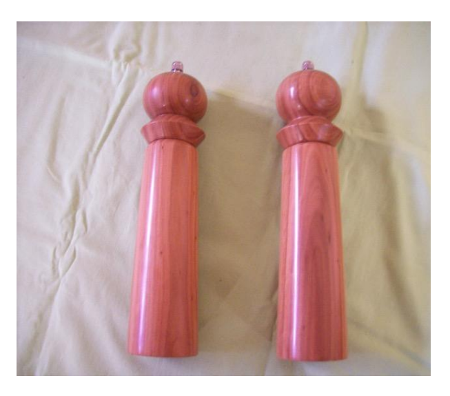
Salt & Pepper Grinders Harold Soans