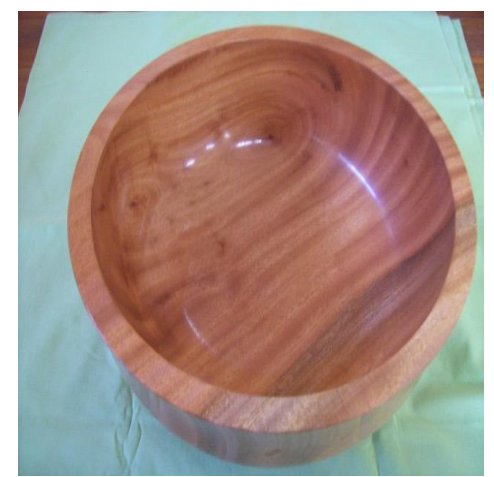
Largest bowl from nest

We meet on the first and third Saturdays every month, and welcome all members and prospective members to our meetings, which go from 9.00am to whenever.