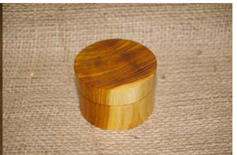
Bill Shean: Left: Box in Mahogany Centre: Pyrographed Hoop Pine Rectangular bowl Right: Box in Osage Orange