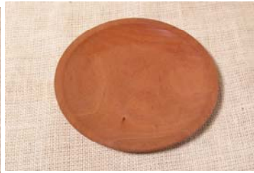
FS: The egg bowl. Unknown timber