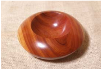
PH: Dead finish