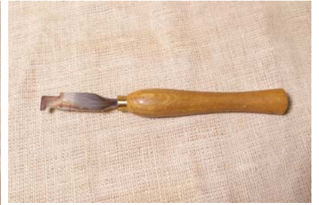
Bruce Everett's pieces: Salt and Pepper grinders. Ceramic Mechanism. Tool made to cut the internal groove of the mechanism