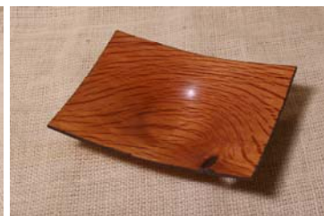
Bill Shean: Casuarina, pyrographed edge