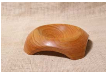
FS: PNG Rosewood