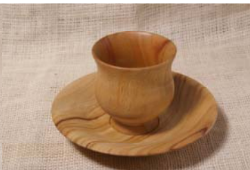
RS: Camphor laurel