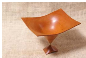
BS: Rosewood & brass rod