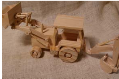
RS: Low loader, radiate pine