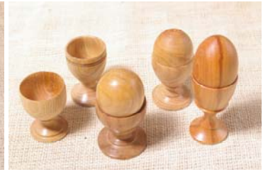
FS: Eggs and eggcups