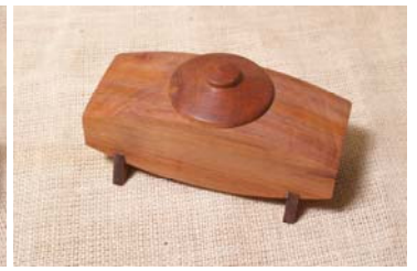
PH: Unknown timber