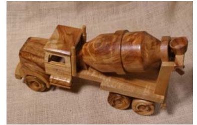
RS: Camphor concrete truck