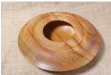
RS: Camphor laurel