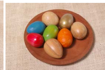
Fred Schffarczyk: bowl of eggs