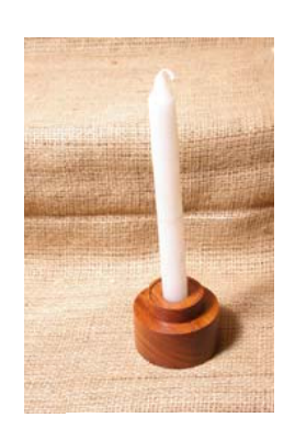
Max Donato: Bowl and multi-candle candle holder