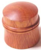
PB: Box in casuarina**