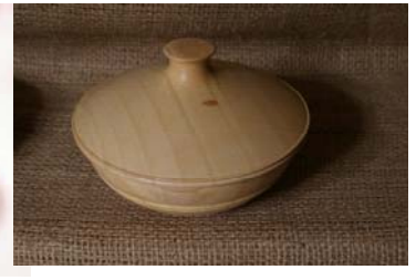
PB: Claret ash lidded bowl