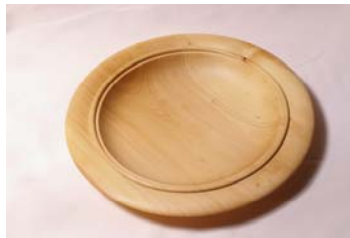
BS: Huon pine platter