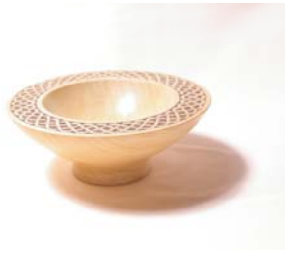
PB; Qld silver ash bowl with pyrography**