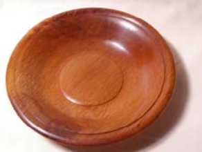
IP: Casuarina bowl