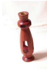
FS: jarrah inside outside candle stick