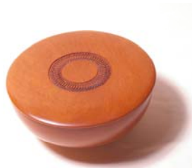
Bill Shean: Rosewood, indexed lidded bowl