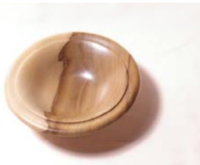
Ian Pye: Black heart sassafras