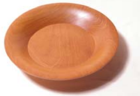
PB: Calantas flat bottomed bowl