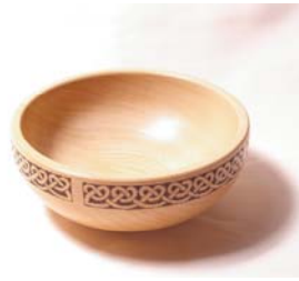
PB: Celery top bowl with pyrography