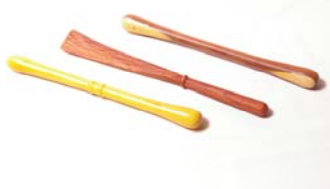
PB: Spurtles in gidgee, osage orange and she oak