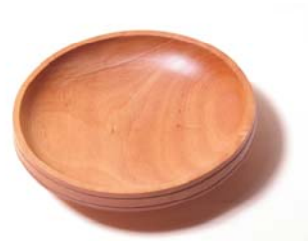
FS: unknown timber bowl