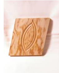
FS: Wall hanging