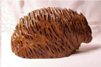
FS: Wombat/rabbit burl