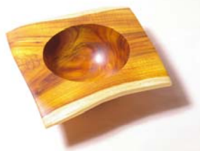
BS: Osage natural edged bowl