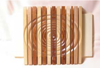
FS: Wall hanging, re-arranged turning