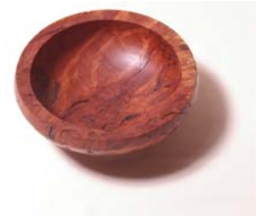
FS: Jarrah burl bowl