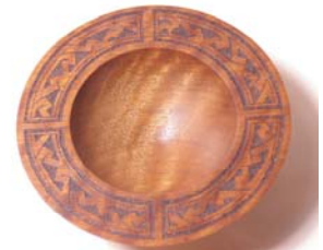
PB: Pyrographed recovered timber bowl