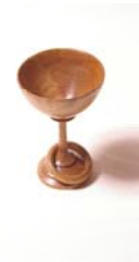
FS: Ringed goblet in cherry