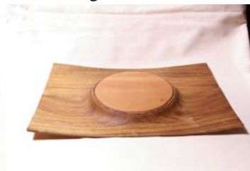
JH: Sally wattle cheese board