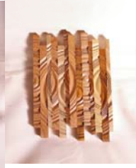
FS: Wall hangings**