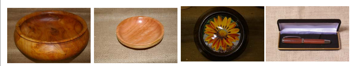
Fred S: Alder bowl, PNG Rosewood bowl, Wenge picture frame, Laser engraved pen