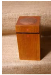
MD: Rimu & Davina Inlays