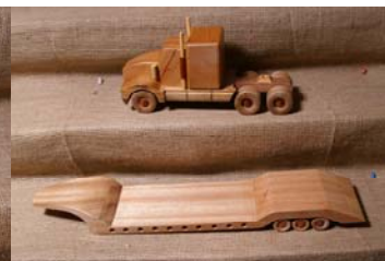
JH: Turck & Flatbed