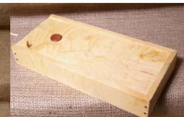
Ian Pye: Huon Pine