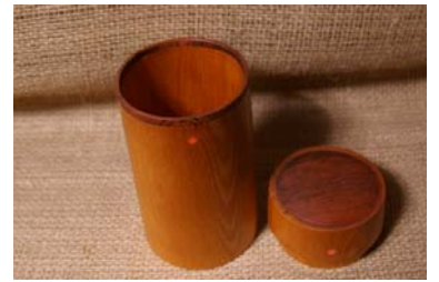
MD: Rimu & Davina Inlays