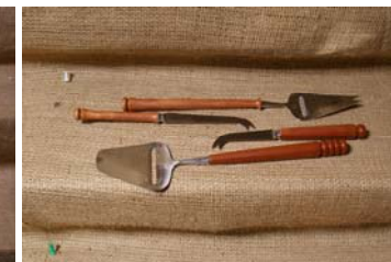
JH: Rosewood & Cedar