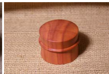
PB: Myrtle Beech Box