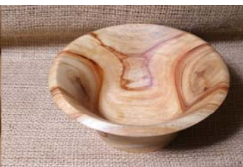
PB: Camphor laurel