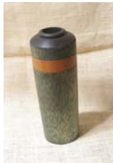
Max Donato: vessel in pacific maple & paint