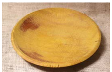
Bill Shean: Pot pourri bowl in jackaranda and paint, textured bowl in casuarina, textured bowl in osage orange (unfinished)