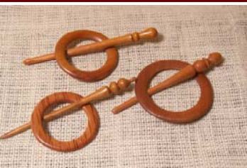
Bill Shean: Shawl pins and rings, various timbers, jig to make rings