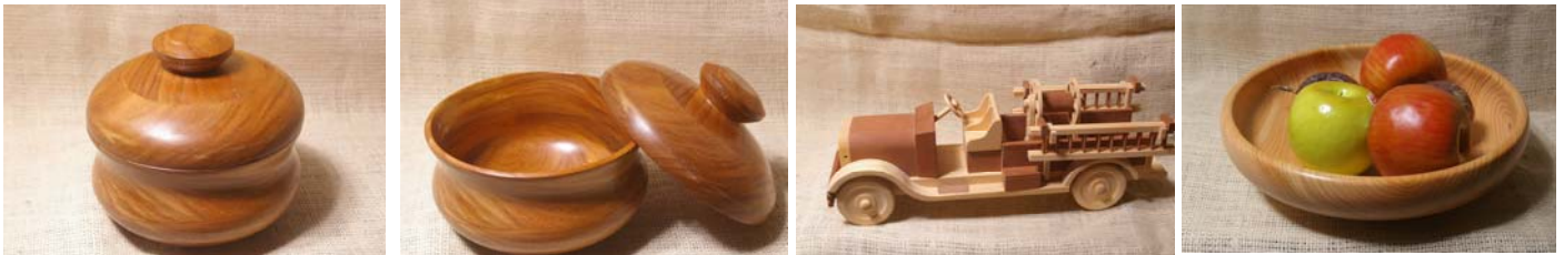
Lou Sackett: Lidded bowl in PNG Rosewood