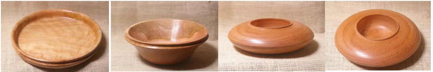
Lou Sackett: Platter in cryptomeria, bowl in tiger myrtle, bowl in sirrium.