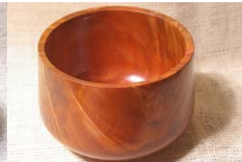
Byron Grant: Bowl in PNG rosewood and mahogany insert.