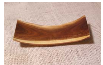
Bill Shean: Gidgee natural