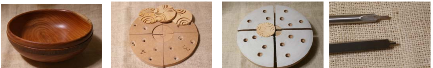
Bill Shean: Blackwood bowl with textured rim, 2 x jigs for cole jaws for offset pieces, tools for same