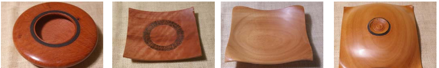
Bill Shean: Red gum hollow form with pyrography, myrtle square bowl with pyro, mahogany square with pyro