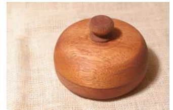
Col Martin: oak porridge bowl, PNG rosewood, jarrah platter, Lidded bowl in maple