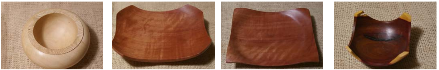
Bill Shean: Spiralled featured jacaranda bowl, myrtle (almost) square bowl, myrtle square bowl, gidgee square bowl