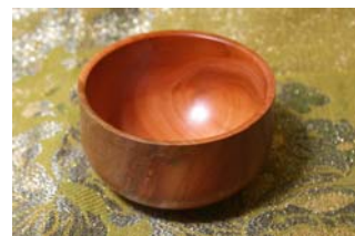
Fred Schffarczyk: Wall hanging in various timbers, Banksia bowl, Kwila Box, Swamp mahogany bowl