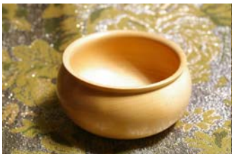
Graeme Webb: 2 pieces in Huon Pine: Bowl, Lidded Bowl