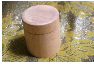
JBill Dinning: 2 boxes in Pacific Maple