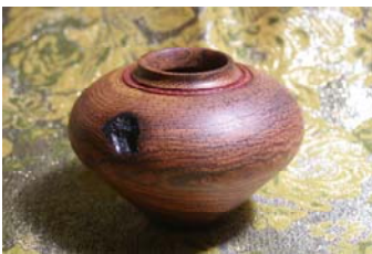
Joe Kinsella: Hollow form in Blackboy Root and Open form in Black boy root.