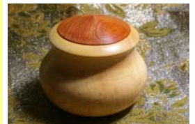
on South: Lidded bowl in luon and PNG Rosewood

July Meeting 18th July 1 week early. Richard Raffan Start 10.00am sharp.