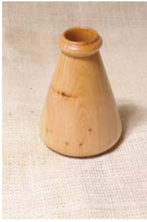
Graeme Webb: Hollow form in Macrocarpa & Box in Rose sheoak