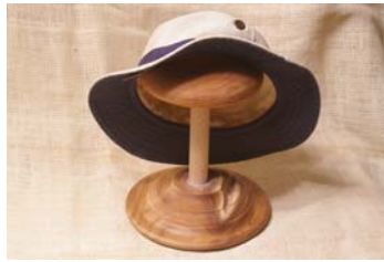
Ian Pye: Hat Stand in Sally Wattle and Cedar