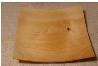
Bill Shean: Square bowl in huon.