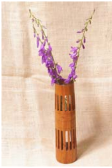
Max Donato: vase in firewood