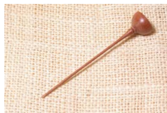
Ken Sullivan: Tembleurs, broken and complete