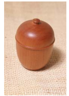
Bill Shean: Box in myrtle