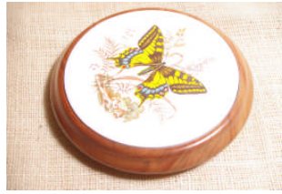
Graeme Webb: Tiled trivet in Camphor, lidded bowl in Rosewood