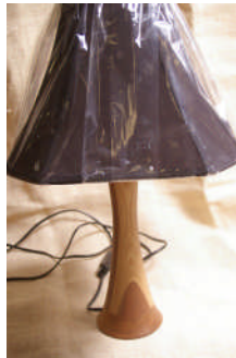
Ian Pye: Lamp in PNG Rosewood and segmented bowl in Blackwood