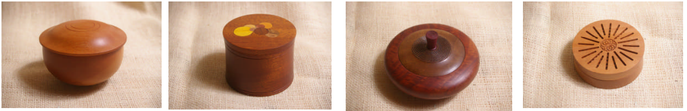
Bill Shean: Lidded bowls in Rosewood, Mahogany, Redgum & Walnut, and Myrtle

Project for September was either a lamp or a candle