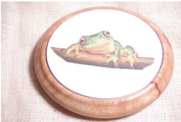
Graeme Webb: Tiled trivet in camphor, bowl in Myrtle, segmented bowl in oak and others