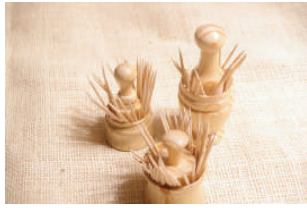
Jim Powell: Toothpick holders in pine