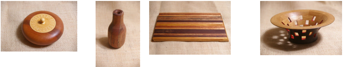
Bill Shean: Lidded bowl in myrtle and huon pine