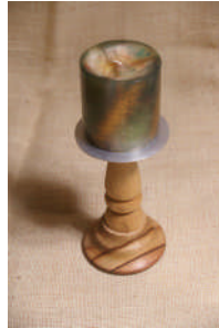
Bob Miller: Candle holder in camphor