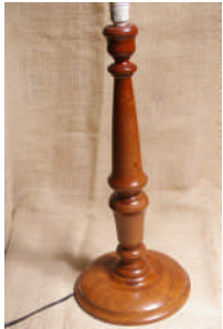
Fred Robjent: Lamp in River Red Gum