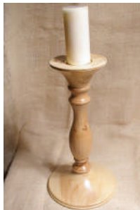
Fred S: Candle holder in Apple and table lamp in Jarrah Burl