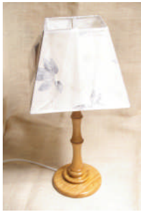
Graeme Webb: Lamp in PNG Rosewood and bowl in Myrtle