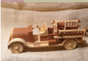
2009 Excellence Award, R South