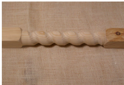
Don Greenhalgh: Barleycorn Table leg in Pine