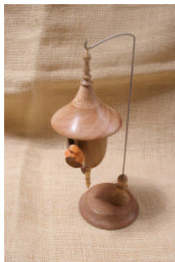
Fred Robjert: Birdhouse in BH Sassafras, Oak