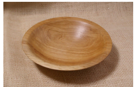
Unknown: Bowl, English Oak