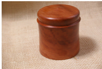
Max Donato: Box in River Red Gum