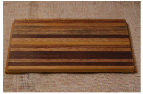
Bill Bailey: Cutting board in meranti