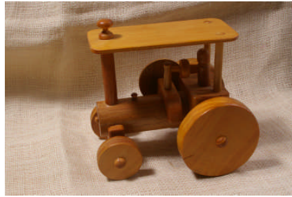
Keith Buchanan: Traction engine, pine