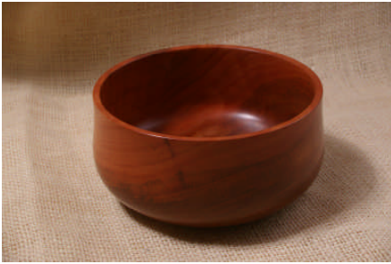
Graeme Webb: Bowl in Swamp Mahogany