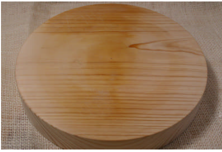
Peter Jackson: Cutting boards in Pine