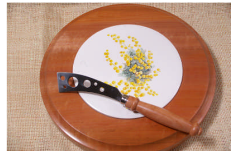
Fred Schaffarczyk: Trivet & Knife in Fig & Myrtle