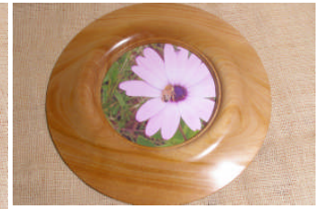
Fred Schffarczyk: Picture frames in huon pine, true oak, jarrah, kauri pine,