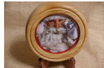
Jim Powell: Lidded bowl, Box, picture frame