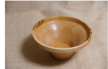
Jim Powell: Vase, pencil box, plate, bowl