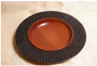
Bruce Everett: Pyrographed turpentine dish