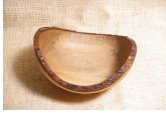
Graeme Webb: Natural edge in camphor, Stand in Qld r'wood, Square bowl in PNG R'wood