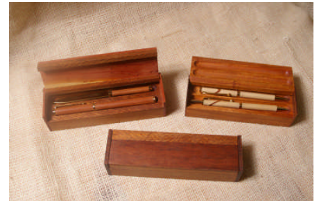
Max Donato: Boxed pen & letter opener, pen & pencil, Rosewood & Illawarra Plum