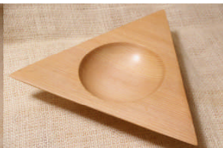
Ian Pye: 3 legged triangular bowl, western red cedar