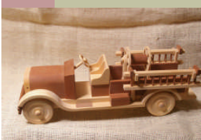
2009 Excellence Award, R South