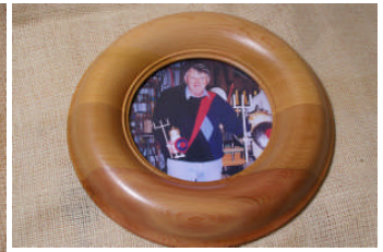
Graeme Webb: Picture frame, with photo of John Page, WR Cedar