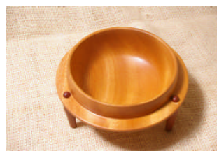
Roger Wilson: 3 legged bowl in PNG rosewood