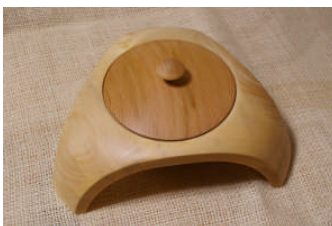
Graeme Webb: Lidded 3-legged bowl in gingko biloba & WR Cedar