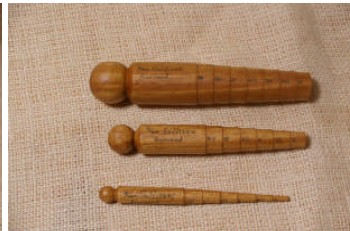
Ken Sullivan: Curnone sticks in rosewood