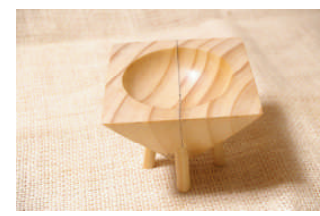
Ian Pye: 3 legged pine bowl