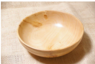
Jim Powell: Bowl in pine, painted dish