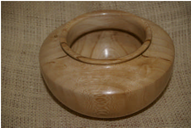
Ian Pye: Bowl in jacaranda