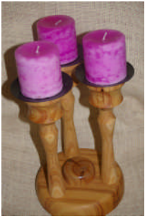
Bob Miller: Triple candle stand in cypress, lidded toothpick holder in jacaranda and Sydney blue gum , vase in cypress