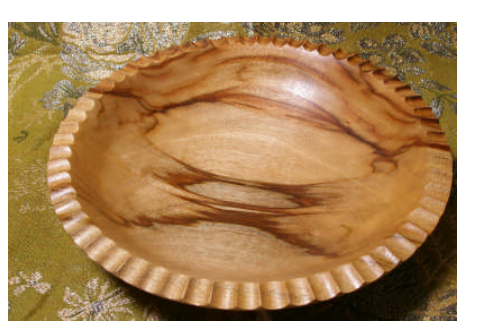
Bill Shean: Carved edge bowl, Jackaranda - Square pedestal platter, Myrtle - Carved edge bowl, Camphor laurel