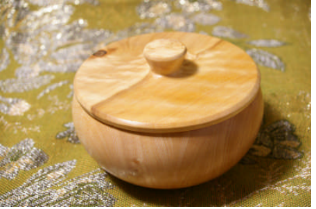
Bill Shean: Natural edge bowl, unknown; Needle cases, Blackwood, Rengas & Celery top pine; Lidded bowl, Jackaranda & ash