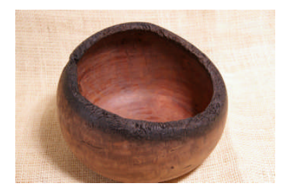
Simon Briggs: Bowl, back fence