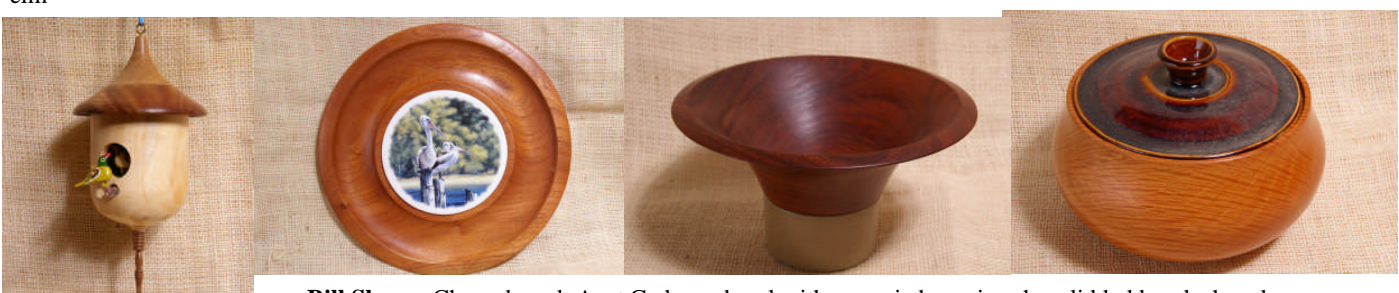
Bill Shean: Cheeseboard, Aust Cedar - bowl with ceramic base, jarrah - lidded bowl, sheoak