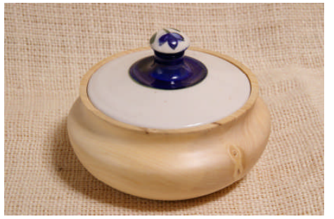
Max Donato: Lidded bowl, ceramic lid, PNG rosewood - 2nd ginkgo