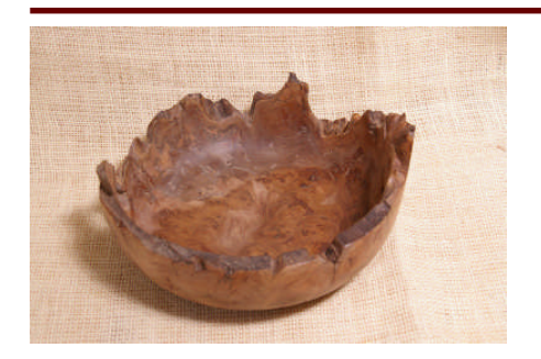
Simon Briggs: Bowl, Natural edge bowl, elm