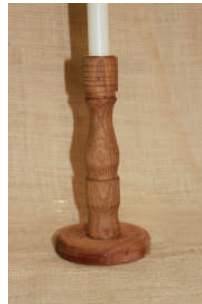
Peter Jackson: Candlesticks– Oak, Pine/Maple