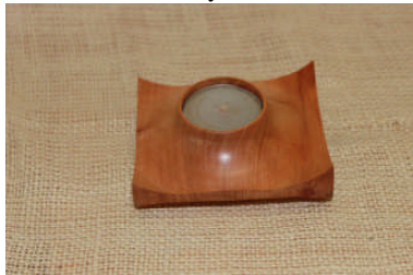
Rees Bunker: Assymmetric candle holder, Fijian mahogany