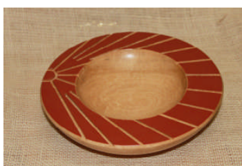
Bill Shean: Bowl, painted & routed