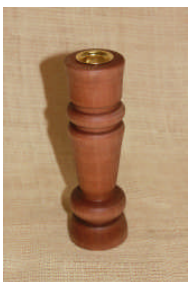
Alan Barker: Candlestick, Coachwood