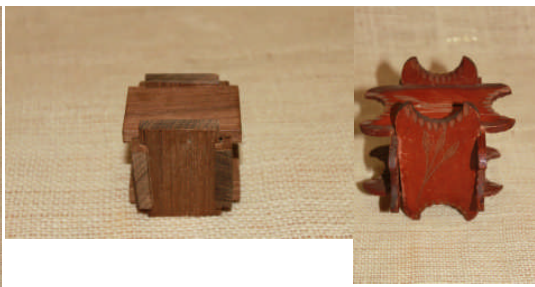
Ken Sullivan: Puzzle point box, antique point box