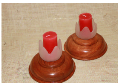
Freddie S: Candle holders - NG Rosewood, Lidded Bowl - Sas-safras