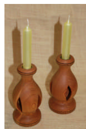
Graeme Webb: Inside out candlesticks, WRC