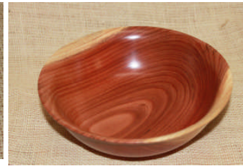
Graeme Webb: Bowl, blackwood