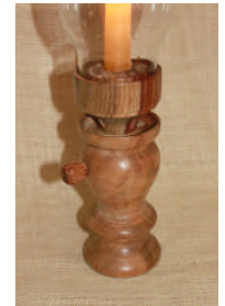
Ron South: Candlestick - Camphor