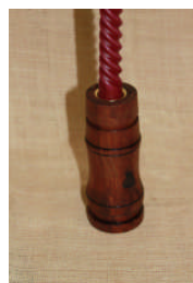
Mick Hurley: Candlestick, blackwood