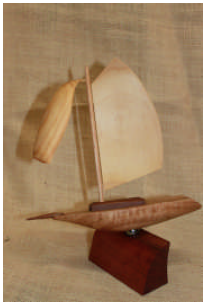
Miax Donato: Sailing ships – huon pine