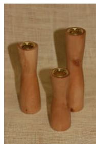
Max Donato: Candlesticks, Silver birch