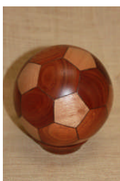
Fred Heasler: Hollow Soccer Ball, Blackwood, Tassie Oak, Silky oak