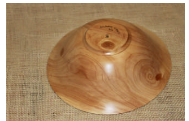
Bill Shean: Lidded bowl— Pine, Myrtle 7 Ceramic, Bowl-cryptomania