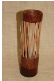
Max Donato: Candlestick, Tas blackwood