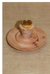
Graeme Webb: WIP