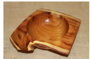
Bill Shean: (L) Lidded Bowl and ceramic lidded bowl, (C) lids swapped (R) Natural edge bowl, osage orange