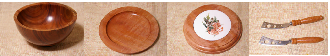
Fred S: Bowl, black wattle-Platter, Myrtle-Cheese platter, Myrtle-Cheese knives, Myrtle