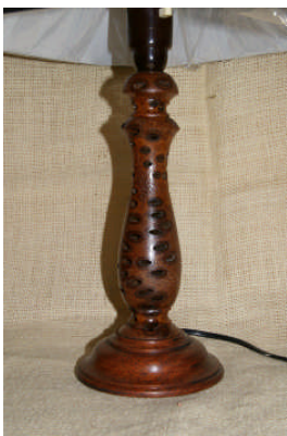
Ian Pye: Lamp, banksia nut