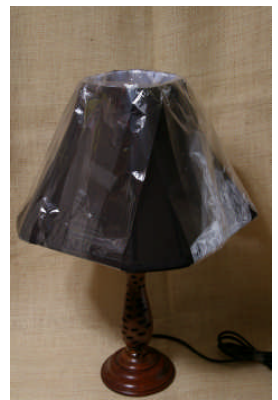
Ian Pye: Lamp-banksia nut