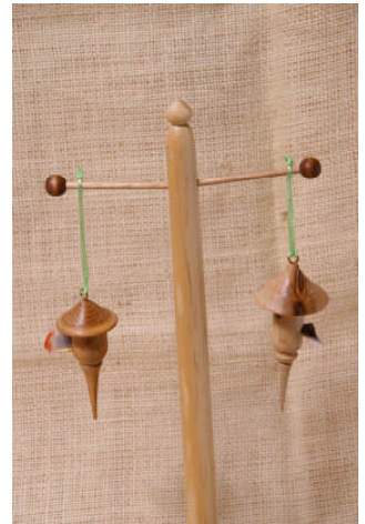
Max Donato: Birdhouses- apricot, cedar, apple, ng rose-wood,