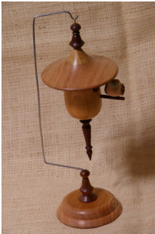
Fred Robjert: Birdhouse- jarrah, qld maple