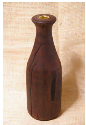
Graeme Webb: Vase, iron bark