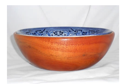
Graeme Webb: Lidded bowls, pottery Rees Bunker: Bowl, unknown lid