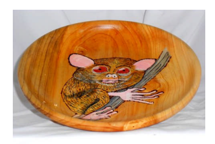
Jim Powell: Platter & pyrography & paint, cryptomeria