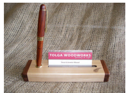
Pen & Business Card Holder