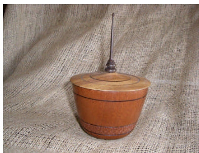
Lidded Bowl, Cedar, Rosewood