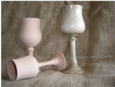
Graeme Webb: Goblets, Camphor