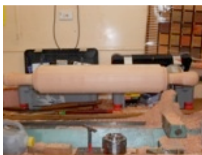
Graeme Webb Rolling Pin Oregon