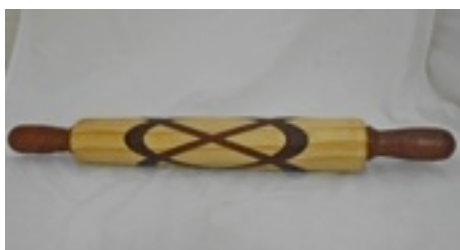
Ron South Rolling Pin Radiata Pine & ??