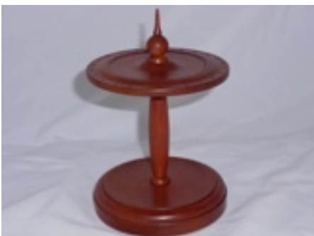
John Harris Earring Stand Rosewood