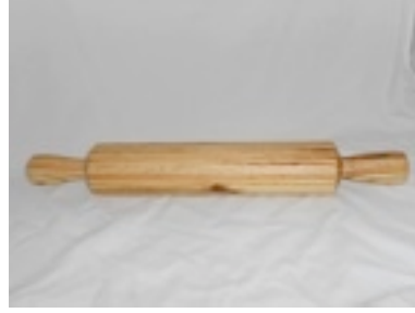
Terry Duffy Rolling Pin Plywood Pin