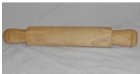
Bill Bailey Rolling Pin, Pine