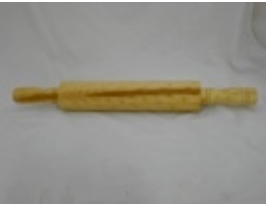
Ian Pye Rolling Pin