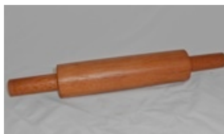
Peter Jackson Rolling Pin Merbau