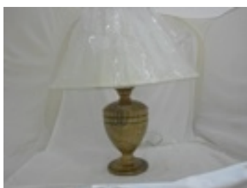
Ian Pye Table Lamp Camphor Laurel