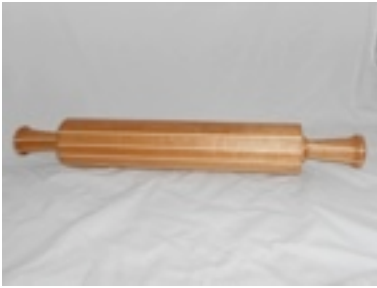
Terry Duffy Rolling Pin Laminated Various