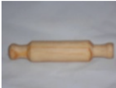
Jim Powell Rolling Pin