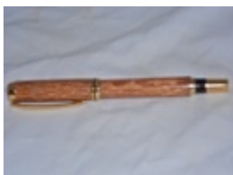
Alex Walker Fountain Pen Silky Oak