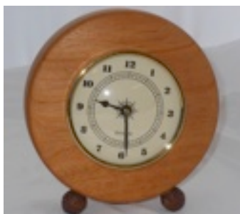
Bob Miller Clock Fijian Mahogany