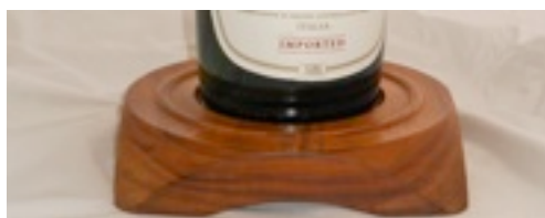
Jim Powell Wine Bottle Coaster