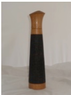
John Harris Hardwood Pepper Mill