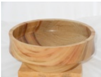
Terry Duffy Bowl Camphor Laurel