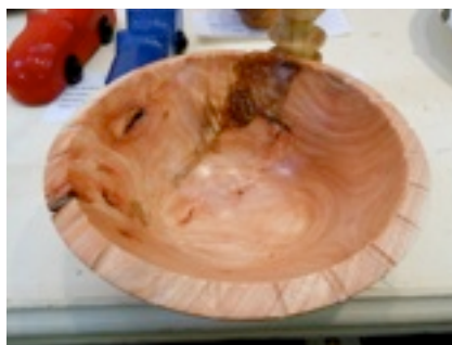
Rees Bunker Bowl Wet turned Blackwood