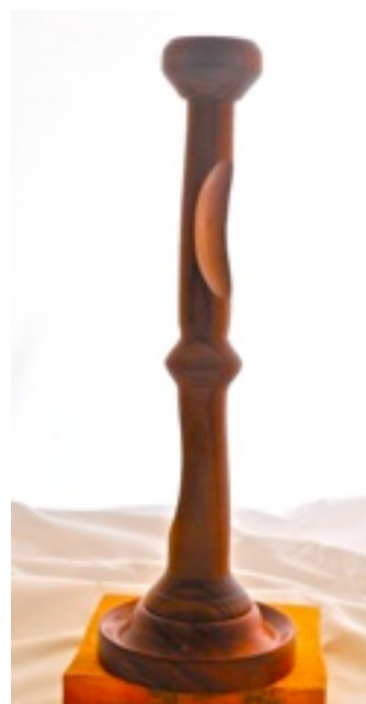
Terry Duffy Candle Holder Blackwood