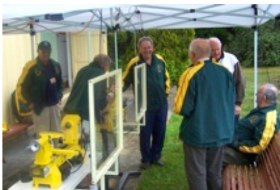
Arts Trail Demonstrator Area