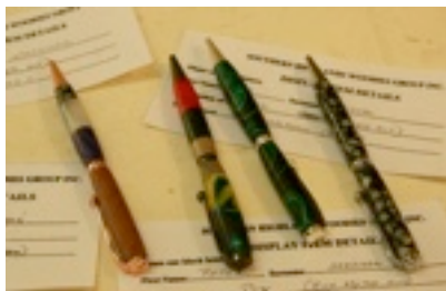
Peter Jackson 4 Acrylic Pens