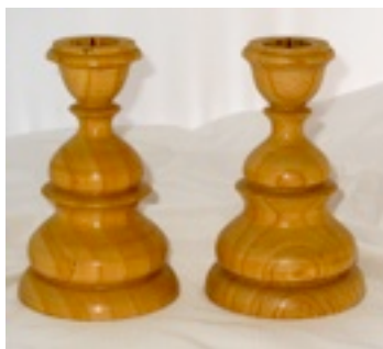
Don Greenhaigh Candle Holders