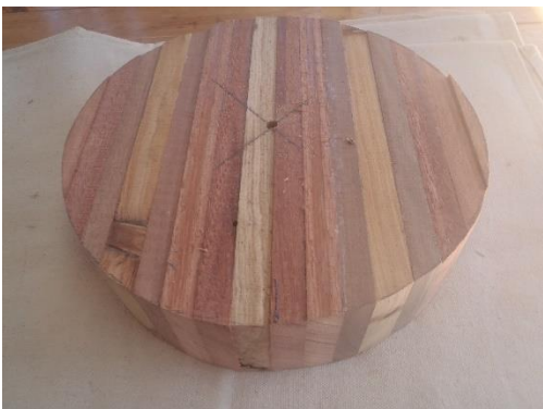
The Round Blank drilled and ready.

I then cut a round blank on the Bandsaw.