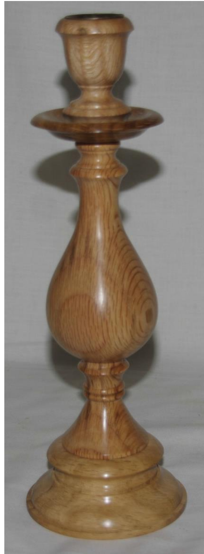
MICK BOUCHARD – CANDLE STICK