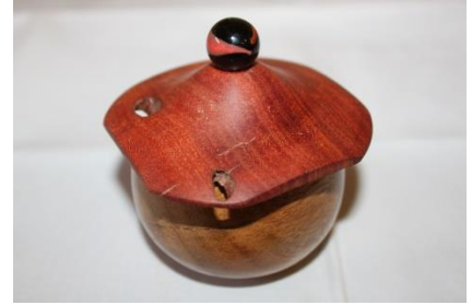
An Mai – Camphor & Rosewood Lidded Box