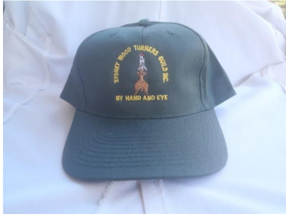
Guild Baseball Cap