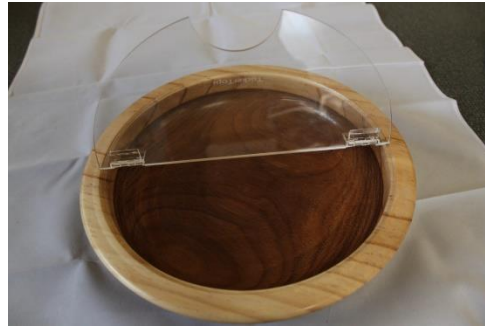
Blackwood and Pine Salad Bowl