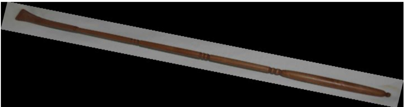
ROB LOVISA – BACK SCRATCHER