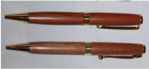
Hecter Fuentes – Oak

Hecter Fuentes – 3 x 500 year old Fitzroya Cupressoides(from southern Chile)