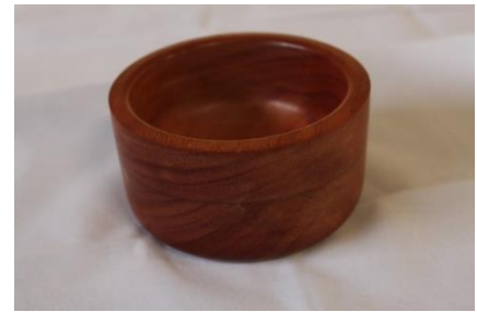
Red Gum Bowl