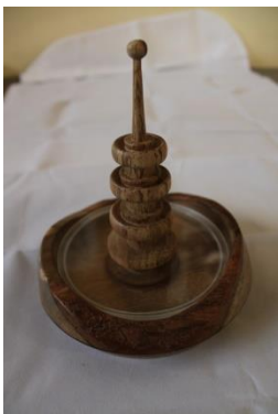
An Mai – 2 x Camphor Lidded Boxes