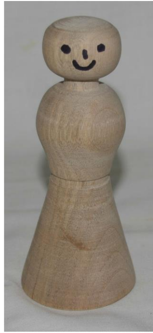
MICK BOUCHARD – TO BE PAINTED