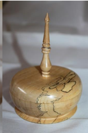
Spallted Beech Lidded Box