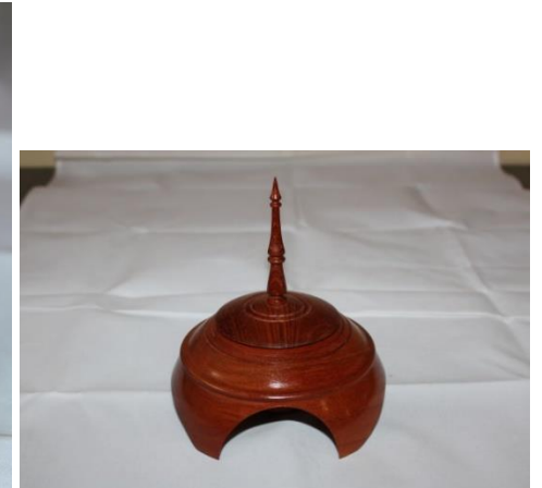
Red Cedar Lidded Box