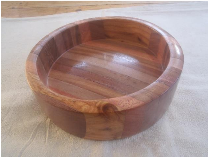
The finished bowl

I have used a similar technique to make 2 cutting boards, though in their case I used a Walnut Oil finish.