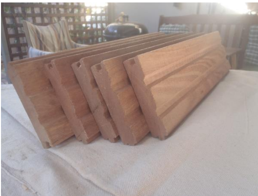
Timber as I received it

I spoke to a number of members of Eastern Region and the suggestions came thick and fast. Lesson 1, Always ask your friends for advice. Some of the suggestions were obvious. Make Spatulas, Pens, and Clocks. One of the wilder suggestions was to make a bowl.