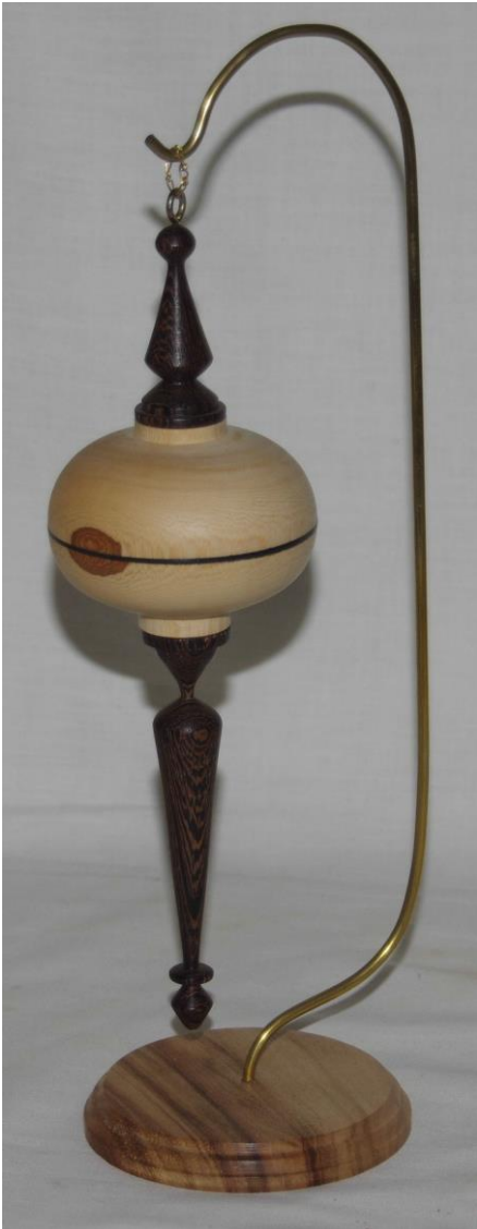
GRAEME STOKES – ORNAMENT