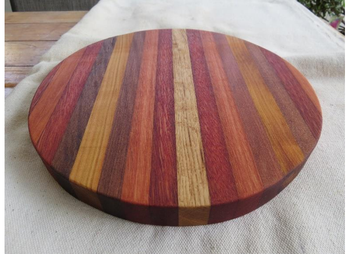
Finished Cutting Board