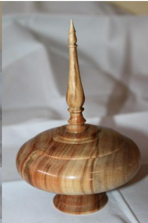
Camphor Lidded Box