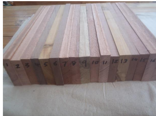
After cutting the tongue and groove off and Going through the Thicknesser

I decided to have a go at a bowl. The first step was to use the Band saw to remove the Tongue and Groove from each side. Once this was done I put the boards through the Thicknesser to remove the underside grooves this ensured that both surfaces were perfectly flat.