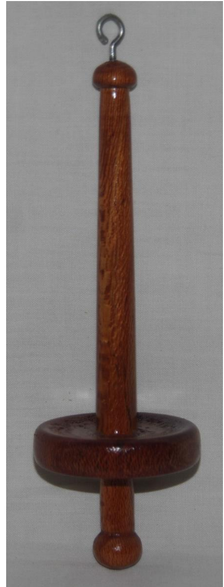
NORM LEWIS – WOOL SPINDLE