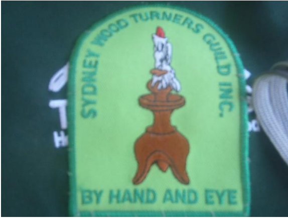
Guild Cloth Patch

Please see your Guild Representative for prices if you want any of these items.