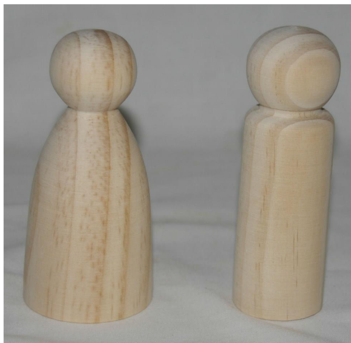
Bill Black Pinus Radiata Boy Girl pair. Set of 25 made for painting