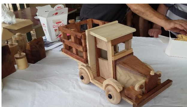
Charles George Wooden Truck