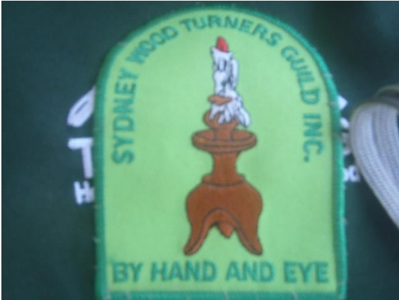
Guild Cloth Patch

Please see your Guild Representative for prices if you want any of these items.