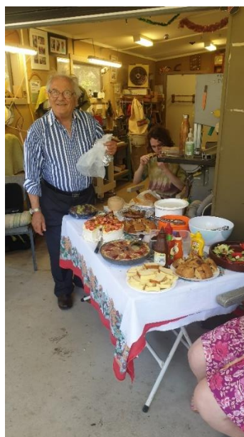
Food, Glorious Food.