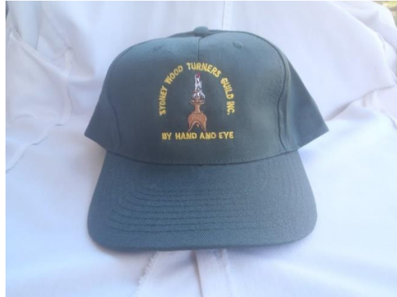
Guild Baseball Cap