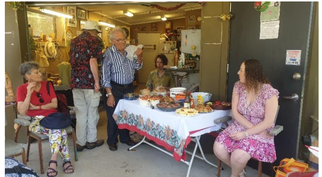
Family and Friends