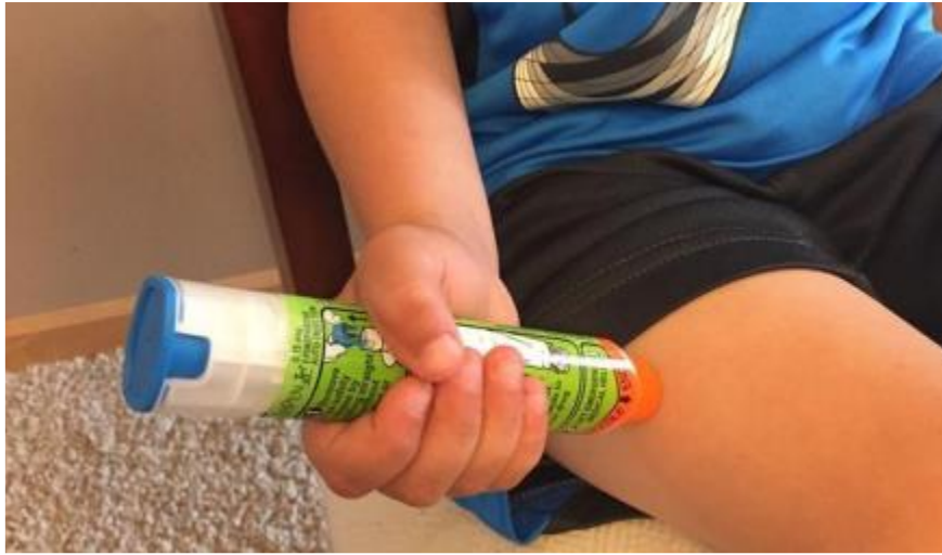
TYPICAL AUTO INJECTOR of EPI PEN.