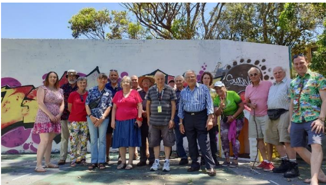
The Gang at the Christmas Celebration

December 19 was our last day of turning and after 1400 the shed tools and equipment were cleaned, sharpened and lubricated as required.