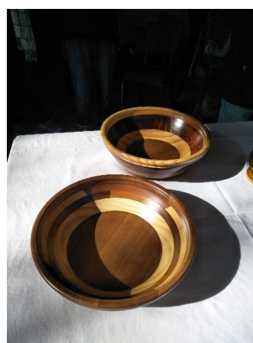
Two Laminated Bowls – Two Pack Finish.