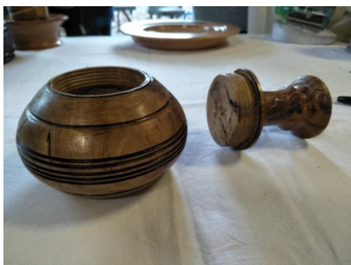
Aladdin's Box – threaded box top