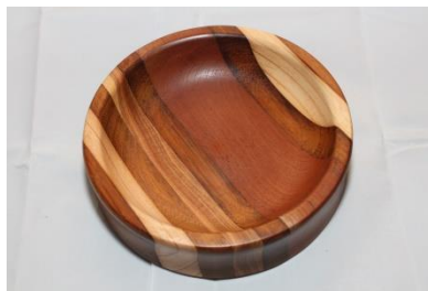
An Mai – 200mm laminated bowl