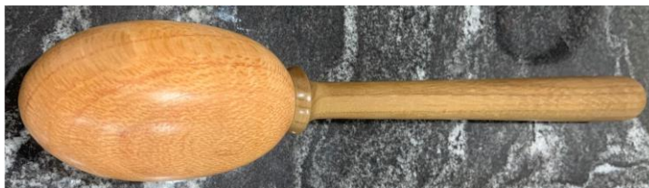
TONY NEY MARACA Silky Oak & Walnut