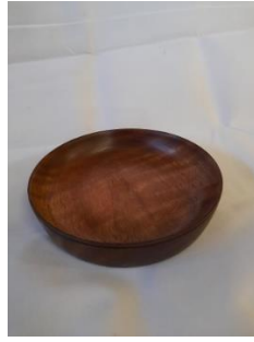
Craig Black – 145mm bowl in Blackwood.