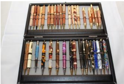
Hector Fuentes – Various Woods and Acrylic Pens