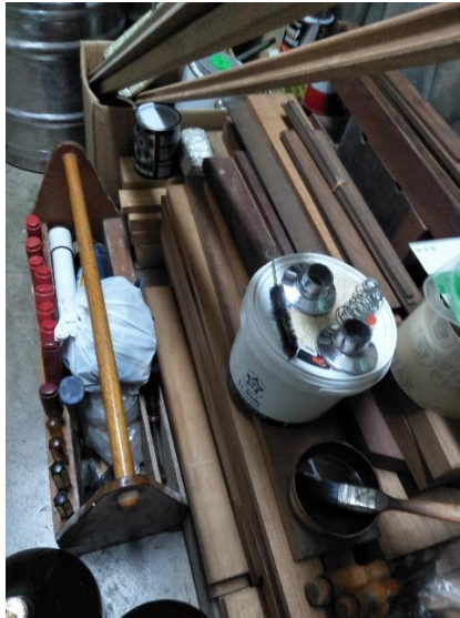
TIMBER – VARIOUS SIZES AND TYPES. MOST OF LARGE SIZE ONE PIECE QUEENSLAND MAPLE APPROXIMATELY 450MM WIDE X 3M LONG X 100MM THICK $1000 NEGOTIABLE. OTHER TIMBERS ARE APPROXIMATELY 2 TO 3 METER BOARDS PRICES ON REQUEST AND BY NEGOTIATION.