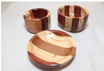
Jarra and Pine Laminated Bowls