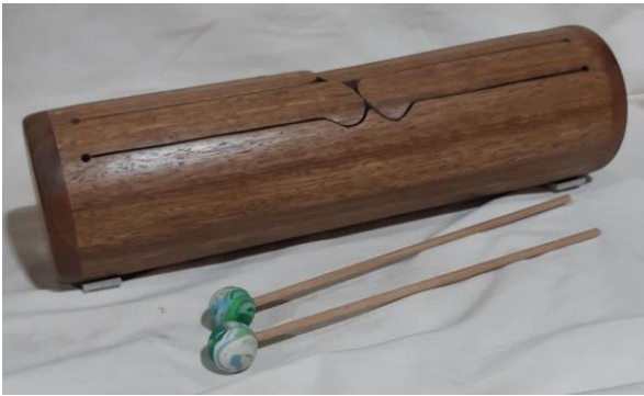
PAUL IBBOTSON TONGUE DRUM Spotted Gum & Black Veneer Urethan Finish