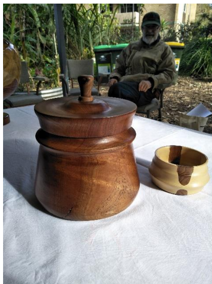
Antonio Imparato – Australian Cedar Biscuit Jar, Small composite pot.