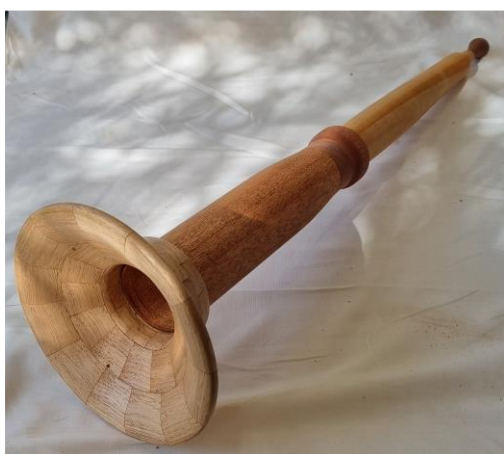
KEITH ALLEN POST HORN (Tuned in A) Various timbers Oil Finish