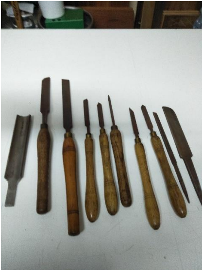
MARPLES WOODTURNING TOOLS MOST SMALL. 2 ND FROM LEFT IS PALM. ALL MANUFACTURED IN UK.