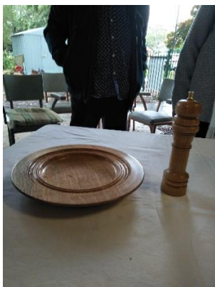
Bill Papalexiou – Silky Oak Platter and Oak Pepper Grinder.