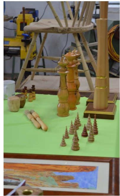
Above - some of the items presented at the May 'Show and Tell'.