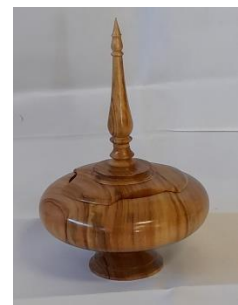
Doug - Lidded jewellery box with finial. Penetrol wood oil finish.