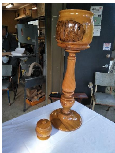
Steve Rutherford – Two views of large pot and stand and small lidded Box - Two pack finish.