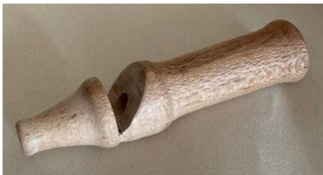
BILL BLACK WHISTLE Silky Oak