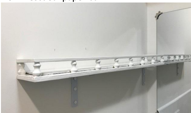
Gerald di Corpo contributed the following photograph of his recently completed 'fiddle rail' and shelf.