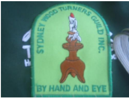
Guild Cloth Patch

Please see your Guild Representative for prices if you want any of these items.