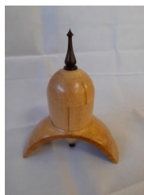
Doug – Lidded box with finial. Penetrol wood oil finish.