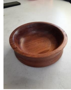
Zoe Pocklington – Bowl, finished with Howards wood wax