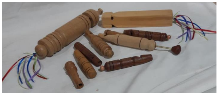
GRAEME STOKES PRIDE OF WHISTLES