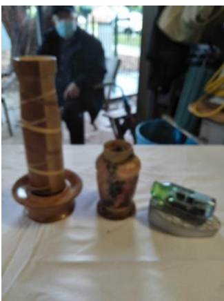
Antonio Imparato – Car in A Bottle, Resin Lamp & Laminated Candle Holder