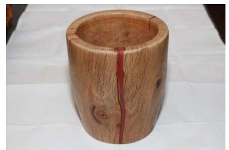
Zoe Pocklington – Red epoxy resin glue, wood unknown, Aqua Coat finish.