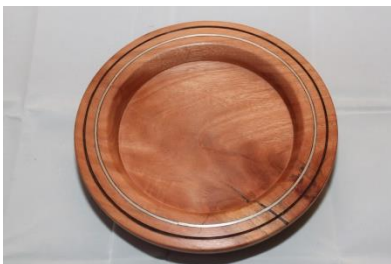
An Mai – 230mm bowl with a soft metal rim inlay