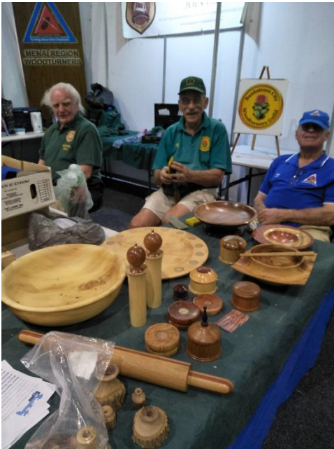
The 3 Mousecateers at the show with display items in front.

There were very few times when there was not a crowd of people around the demonstration area. This was very pleasing. There were also a few pieces out on display, and had we been able to sell profits could have been made. For those who do not know we get the stand at the show almost free from the RAS. If we were to start selling product we would be considered a commercial organisation and have to pay for the stand. And if you have been to the show you will know what that does to the price of things.