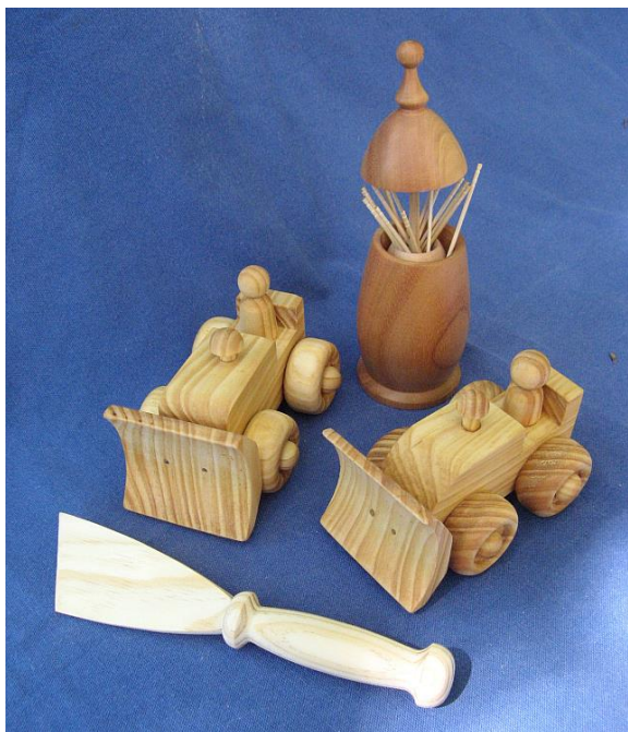
Rupert Linn.... Two beautiful finished bull dozers made in pine and a matching small pine spatula. The lidded TPH showed us all how it should be done.