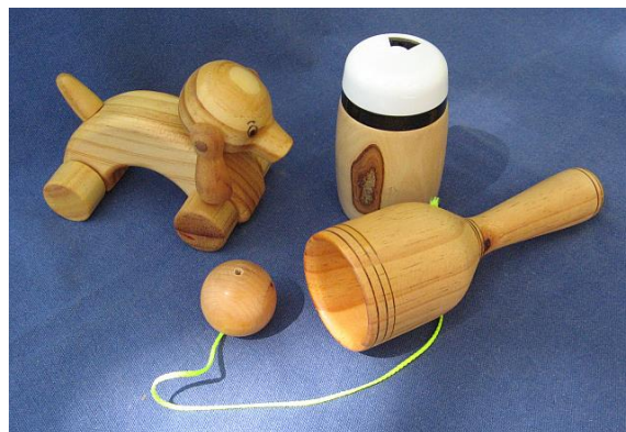
Lloyd Ross... A TPH that also used some left over material from the previous challenge inserted into olive wood. A toy dog from pine and a "cup and ball" toy also made from pine