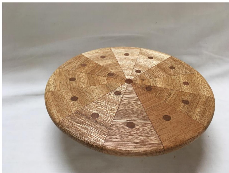
Keith Allen – Decorated Platter – Segmented Merante with dowel end grain decorations – finished with canola oil