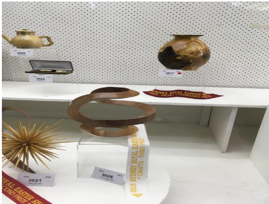
Arthur's Ribbon Form turning