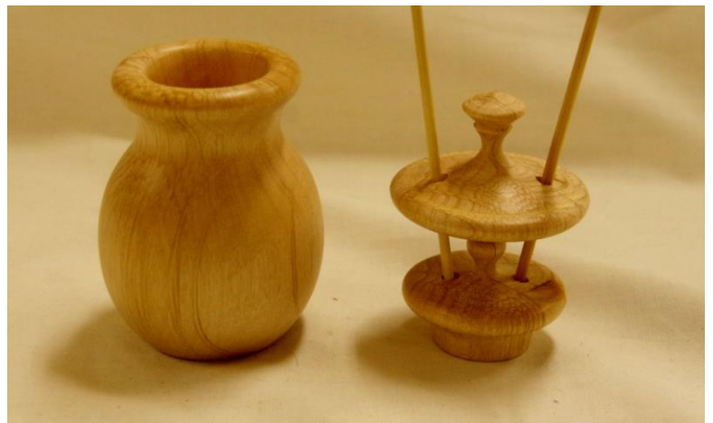
This month's winner - Arthur succeeded with this Queensland Poplar creation - Finished with EEE Cream.