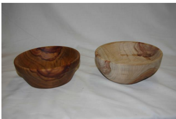
Bob's 2 Camphor Laurel Bowls