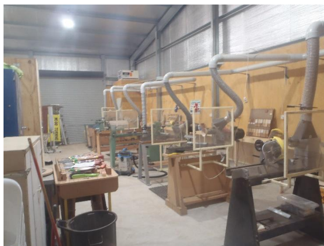
11 LATHES WITH DUAL DUST EXTRACTION READY TO GO