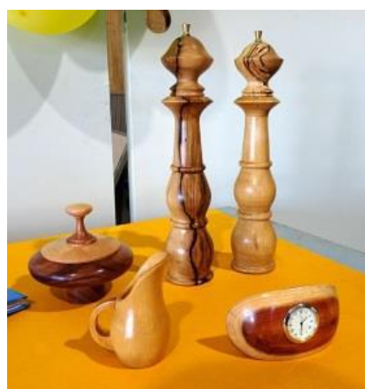
Assorted display items