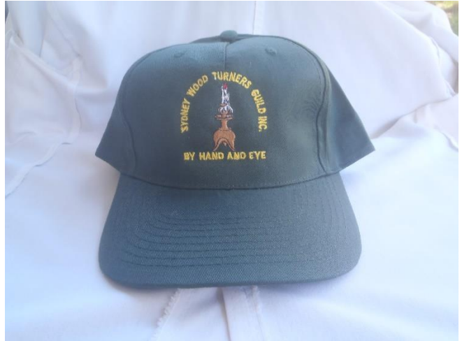
Guild Baseball style Cap $10.00

If there is anything you, or your club wish to sell. Or something you are looking for, let me know and I am happy to put it into By Hand and Eye.