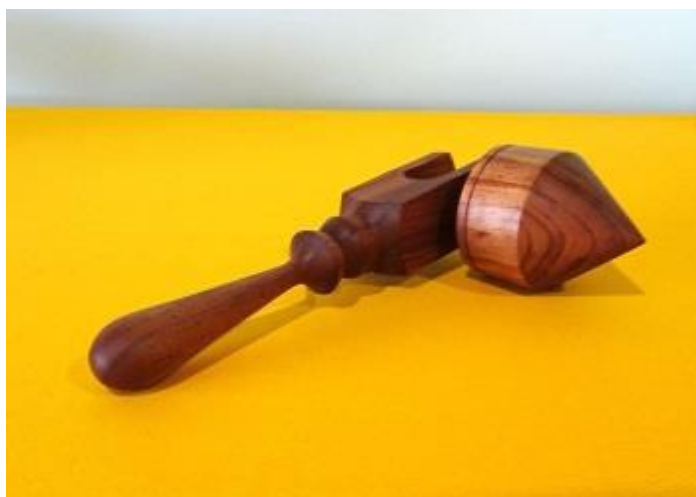
David Prattis: Spinning top Blackwood