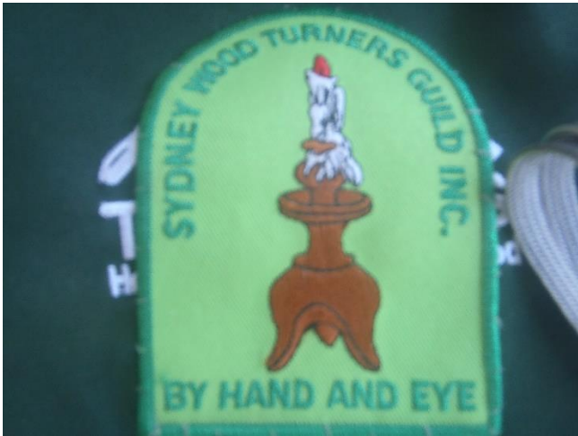
Guild Cloth Patch $6.00

Please see your Guild Representative if you want any of these items. Prices are as marked.