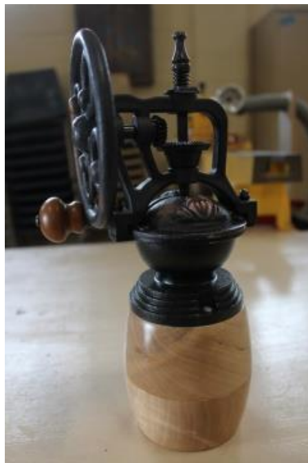
Harold Soans-Jacaranda Coffee Grinder