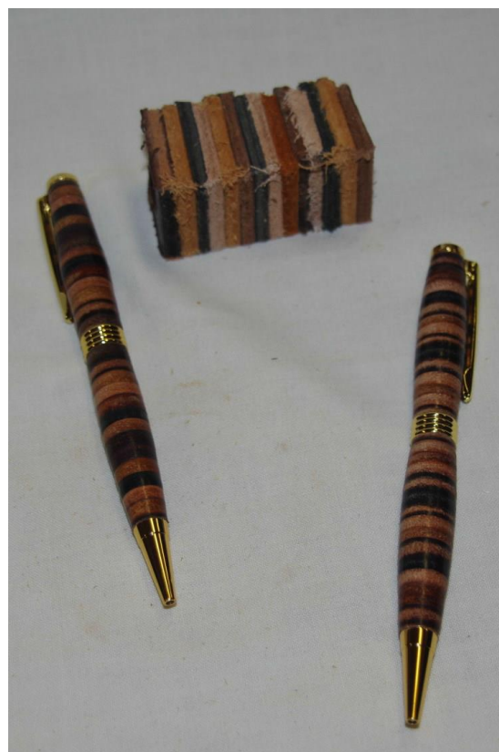
Graeme's Leather Pens