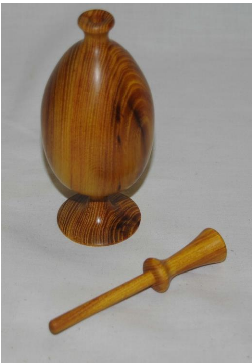
David's Scented Flask - Osaga Orange finished with Self Glow