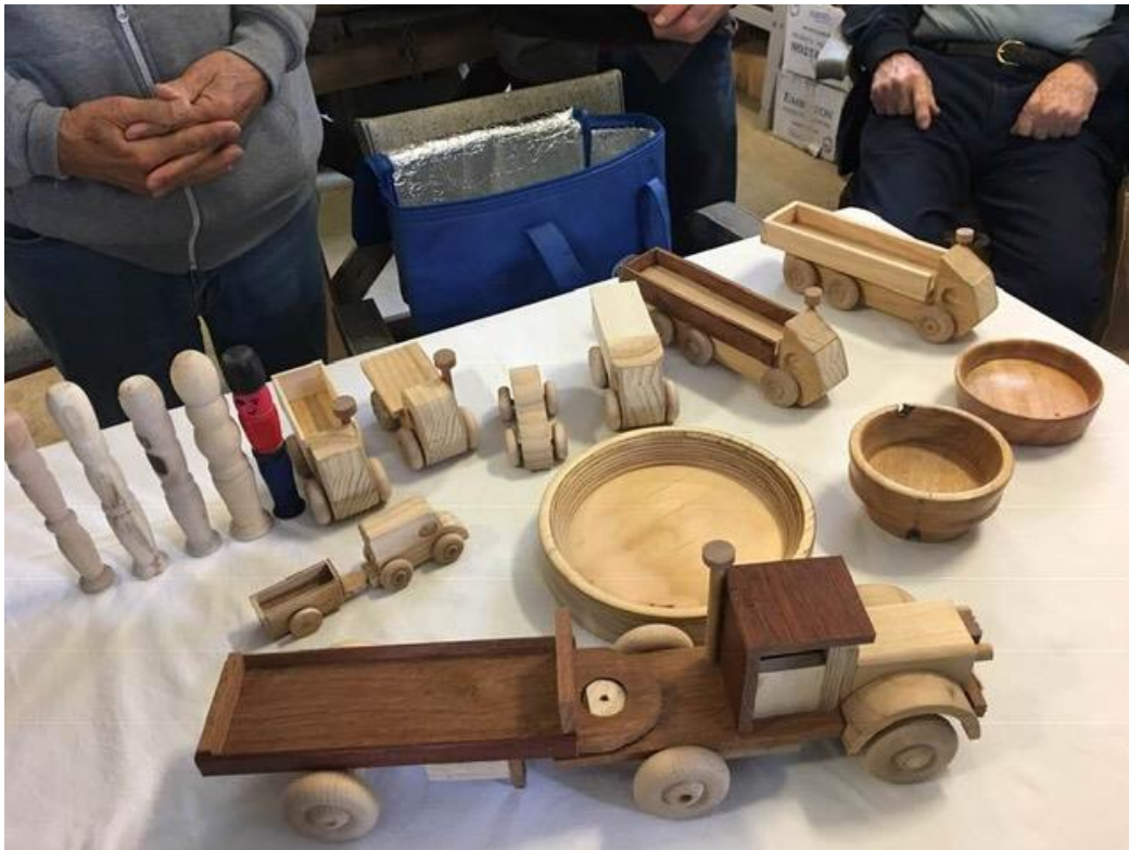
A SELECTION OF TOYS CHARLES GEORGE