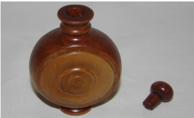
Rob Lovisa - Coachwood, silky oak Insert, Cedar Plug - Estapol Finish