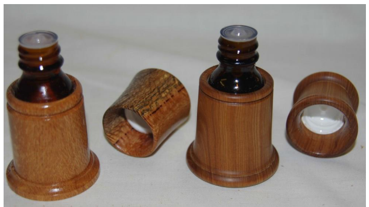
Mick Bouchard - Sandalwood - EEE Finish. Silky Oak - White Shellac