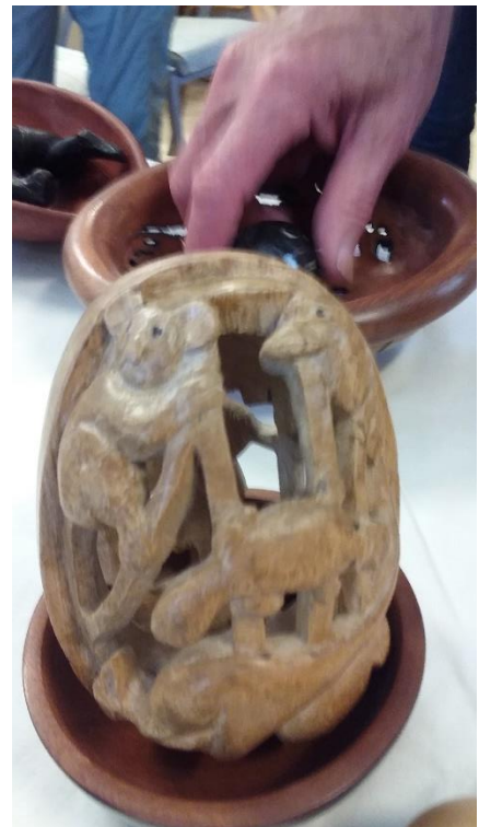
AUSTRALIAN CARVED WOODEN EGG

WANTED TO BUY: Gerry Brady of Eastern Region has a friend who wants to buy a small lathe. Similar in size to one of the Comet Lathes. Gerry can be contacted by phone 9349 5064.