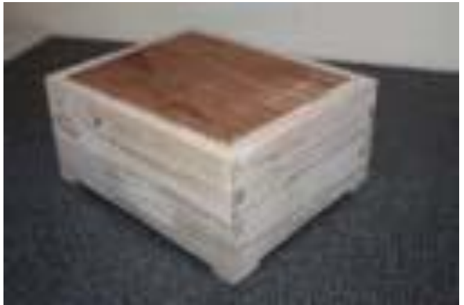
Alf Lord - Dovetail Box