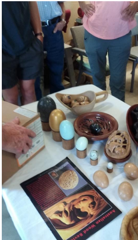
GRAHAM TILLY NESTED EGG CUPS and EGGS