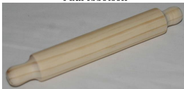
Bill Black – Sushi Roller