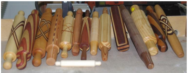
Rolling Pins Galore – most members had a go at this theme.