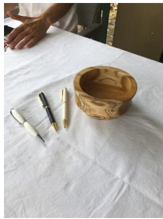
Ailian Cao Acrylic Pens and Osage Orange Bowl