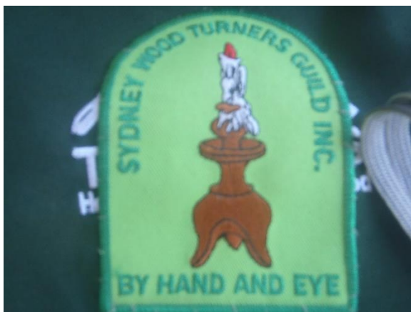
Guild Cloth Patch

Please see your Guild Representative for prices if you want any of these items.