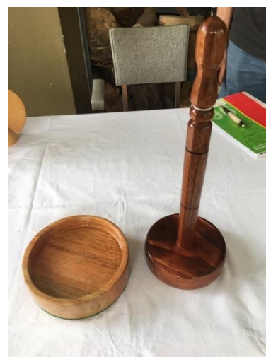
Phil McLeod Tassie Blue Gum Bowl and Paper Towel Holder stained Pacific Maple and Pine