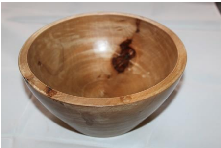
Hecter Fuentes – Eucalyptus