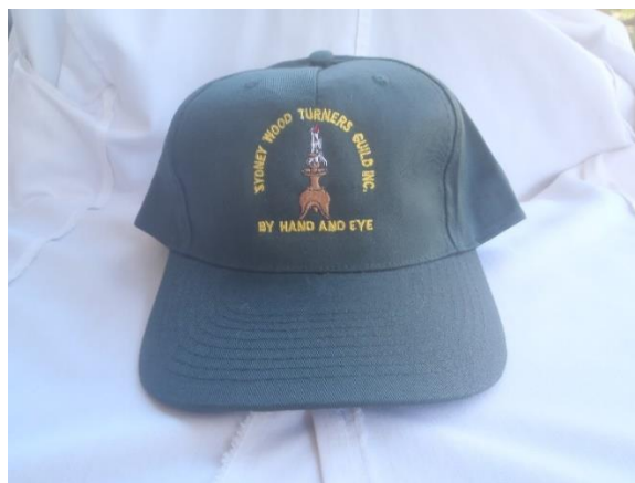
Guild Baseball Cap