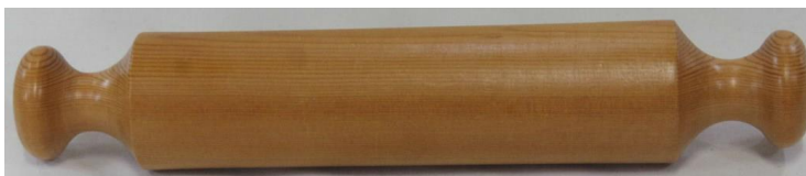
Mick Bouchard – Miniature Roller