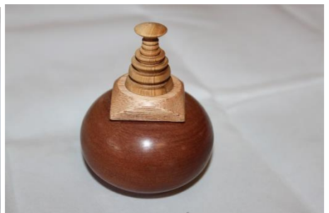
An Mai – Hardwood & Silky Oak Small Lidded Box