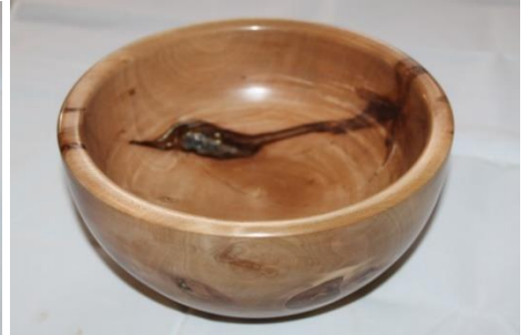
Hecter Fuentes – Eucalyptus