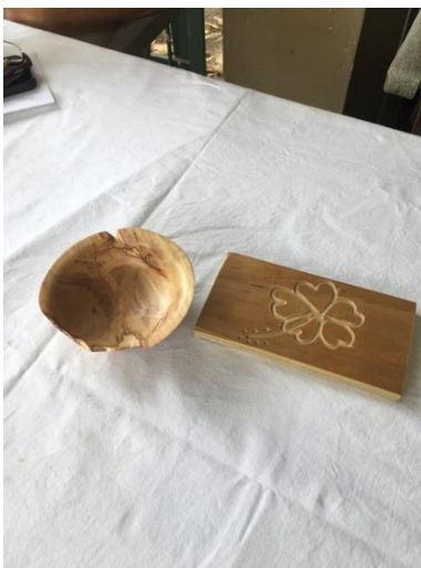
Ashika Menear Small raw edged Bowl and Hand Routed Pattern