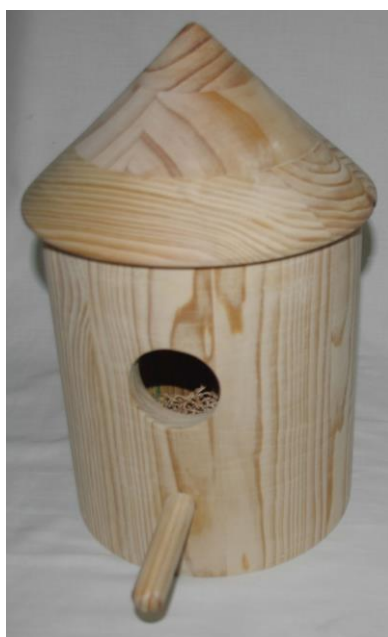
Mick Bouchard – Full size model