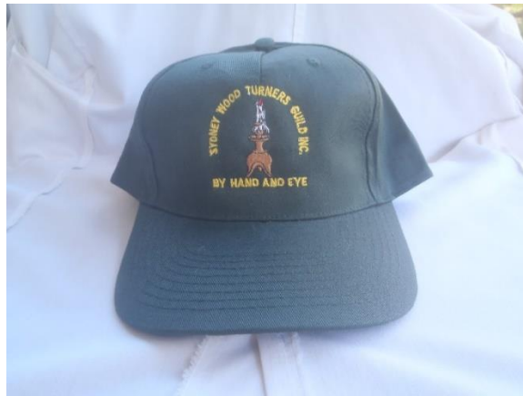
Guild Baseball Cap