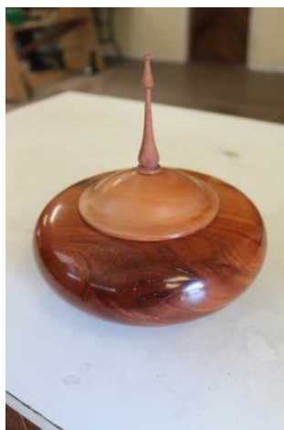
Rosewood Lidded Box