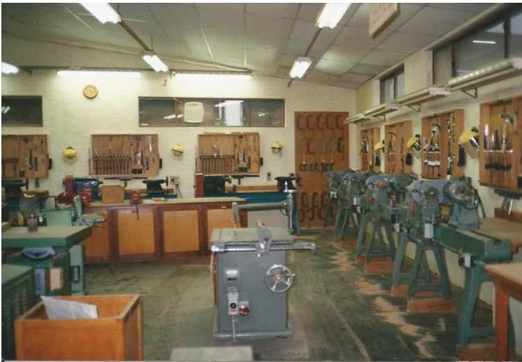
TAFE Work shop 1985