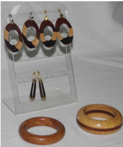
Tony Ney - Earing Stand with Earrings and Bangles