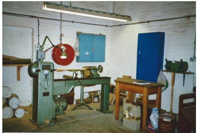
My Workshop when it was a factory.