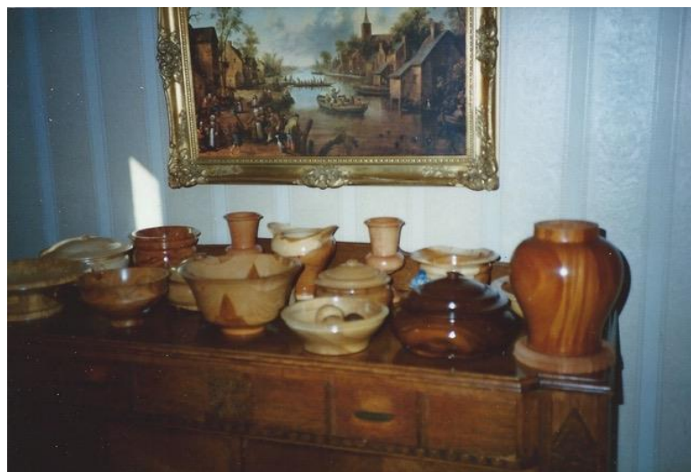
Some of my turnings.