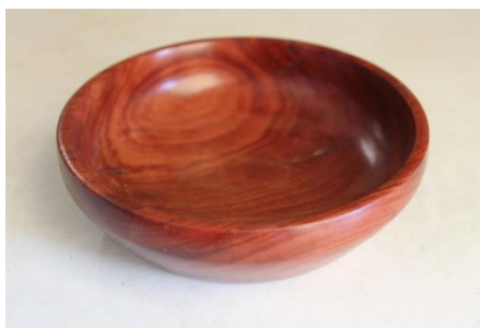
Blackheart Sassafras Bowl