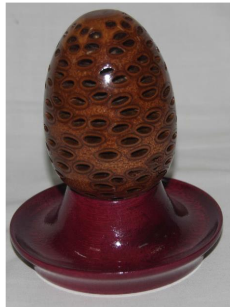
Banksia