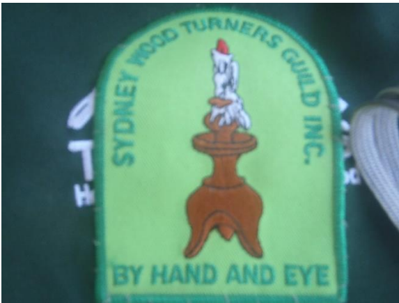
Guild Cloth Patch

Please see your Guild Representative for prices if you want any of these items.