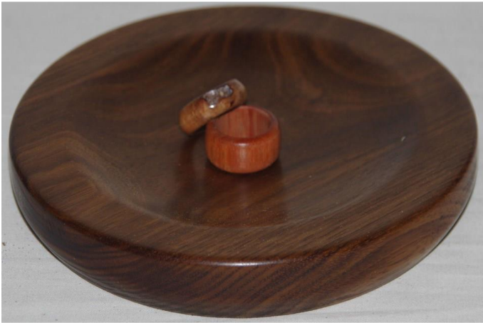
Phil Gray - Two Rings on a dish