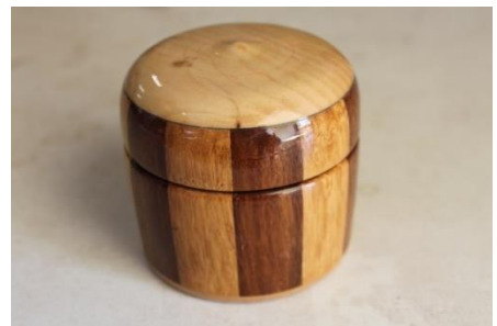
Bamboo Screw Top Lidded Box