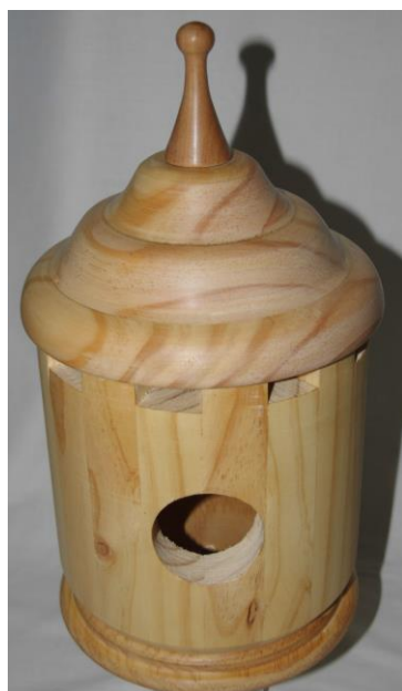
Bob Thompson – Full size Model