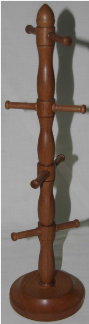
Bill Black - Jewellery Stand