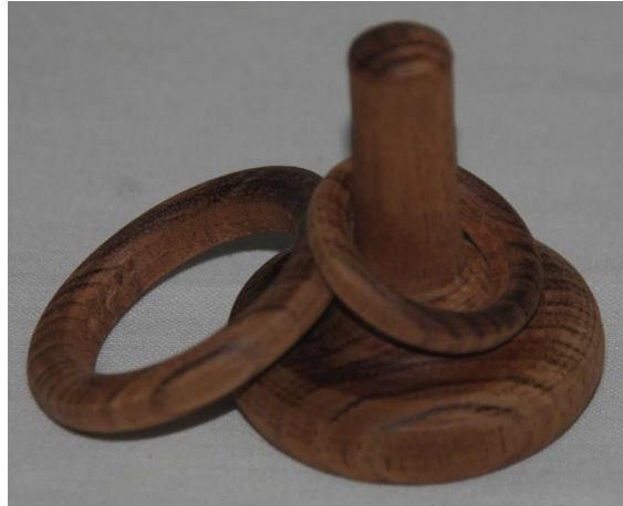
Phillipa Biswell – Ring Stand with Ring & Woggle