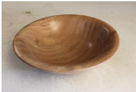
Bowl China Doll