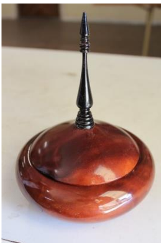
Harold Soans - Red Cedar Lidded Box