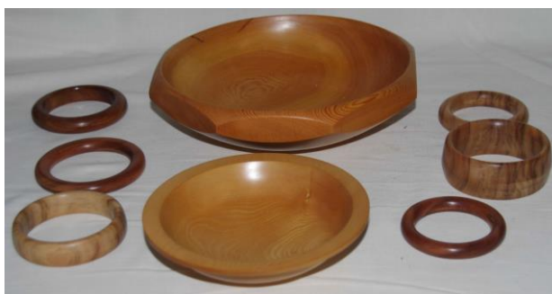
Mick Bouchard - Six Bangles Two Bowls.