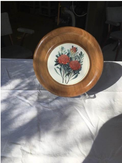
Philip McLeod Cheese Platter With inset tile, Estapol finish.