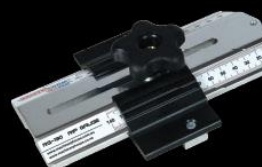
RG-190 Ripping Gauge $59.40 (W311)