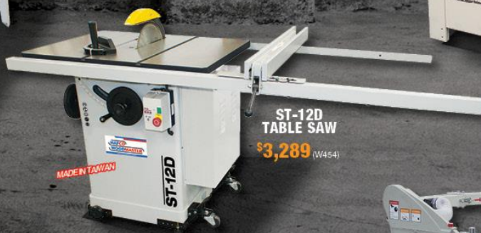
ST-12D TABLE SAW $3,289 (W454)