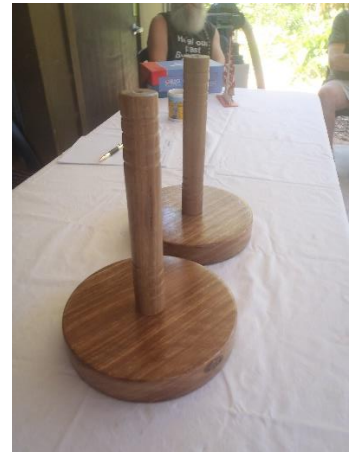
Peter Glaser – Lamp Stands Spotted Gum, Estapol finish. Not finished yet.