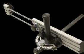
MTR-24 Mitre Gauge & Fence $77 (W308)