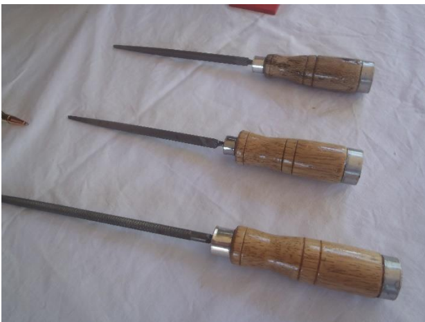
Norm Hoskins – Guest File Handles Turned on $50 Lathe.