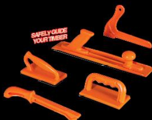
PSK5 - Safety Push Blocks & Stick Set $33 (W309)