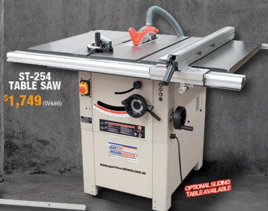
ST-254 TABLE SAW $1,749 (W466)