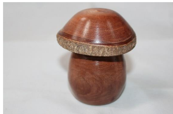
Ted Batty – Mushroom in NZ Christmas Tree