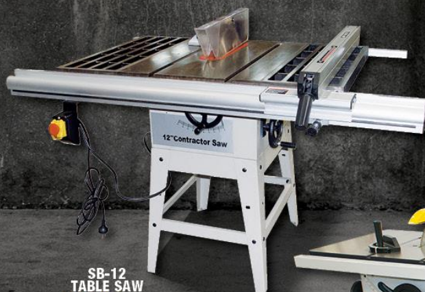
SB-12 TABLE SAW $1,375 (W452)