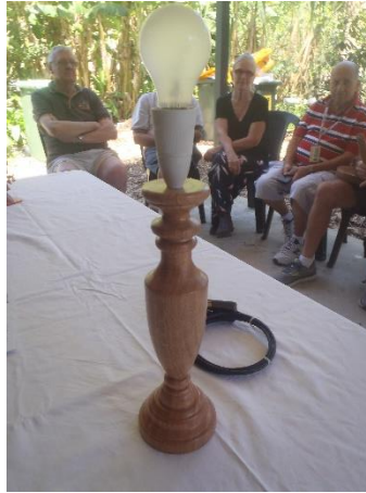
Bill Papalexou – Lamp stand, Silky Oak. Shellawax finish.