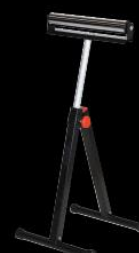
RS-1125 Roller Stand $66 (W343)