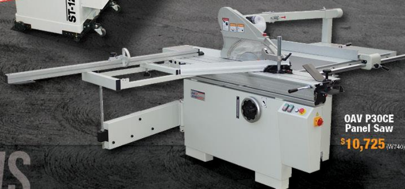
OAV P30CE Panel Saw $10,725 (W740)