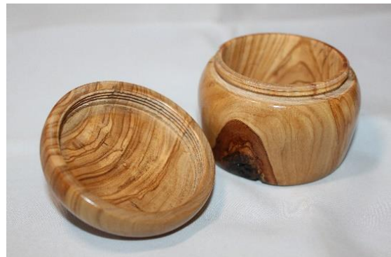
Ted Batty – Olive Box with screw lid removed