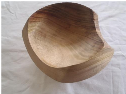
George Xylas – Camphor Laurel Bowl Note the use of the natural strange shape.