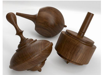
TURNED FINGER TOPS