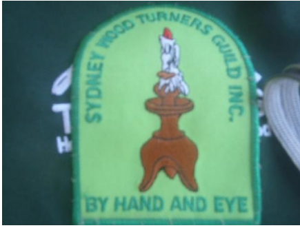
Guild Cloth Patch

Please see your Guild Representative for prices if you want any of these items.