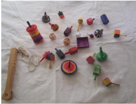
Gerry Brady SNR – various Toys, and three Bowls, the largest with a split and steamed beaded edge. The small platter has hand carved leaves applied to the surface.