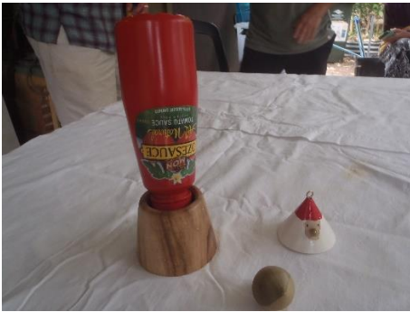
Philip McLeod – Sauce/Glue Stand, Xmas Decoration, Finger Top