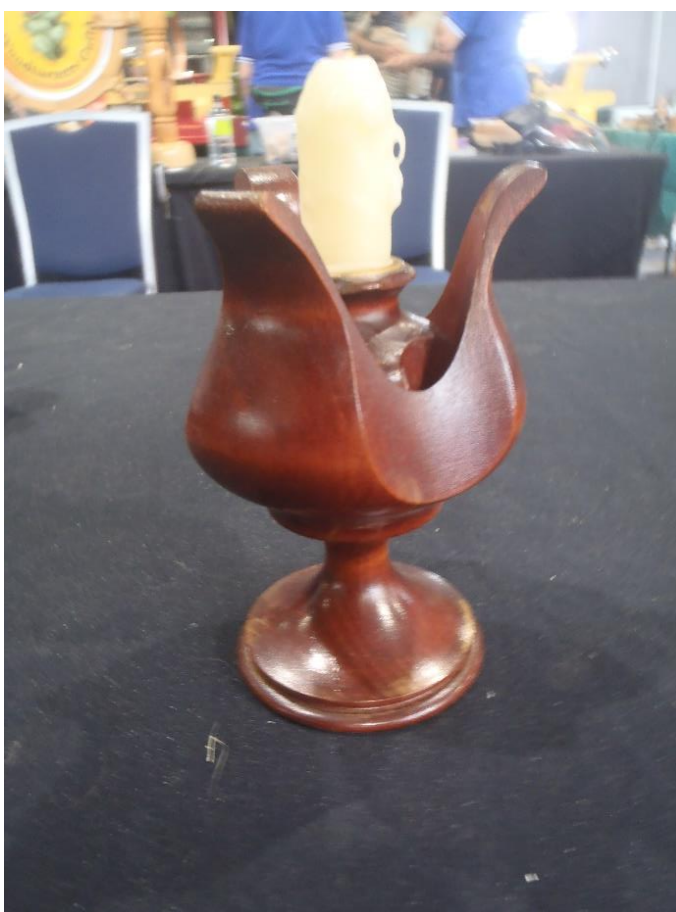
REPLICA GUILD CANDLE STICK SHOWING THE TWO POSSIBLE CONFIGURATIONS