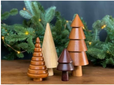
TURNED CHRISTMAS TREES