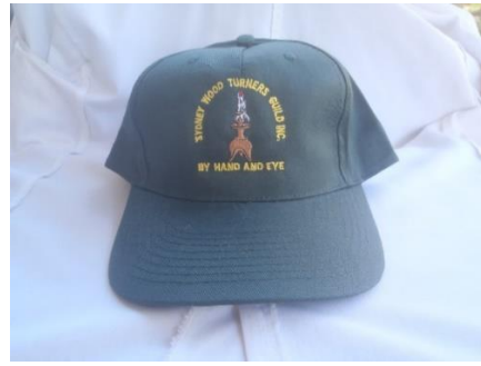
Guild Baseball Cap